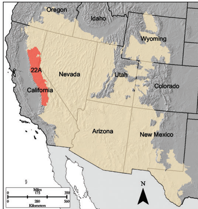
Figure 22A-1: Location of MLRA 22A in Land Resource Region D